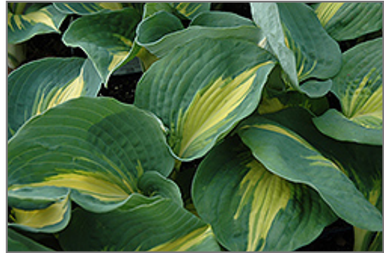
Thunderbolt Hosta foliage