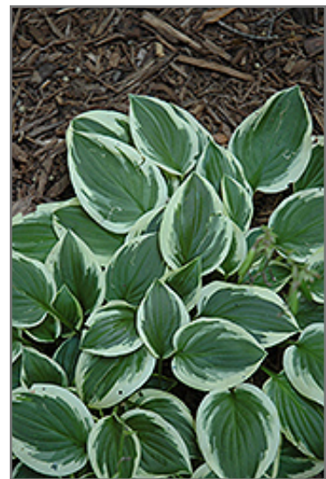
Thumbelina Hosta foliage