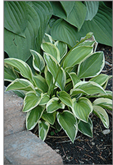
Thumbelina Hosta

Thumbelina Hosta is recommended for the following landscape applications;