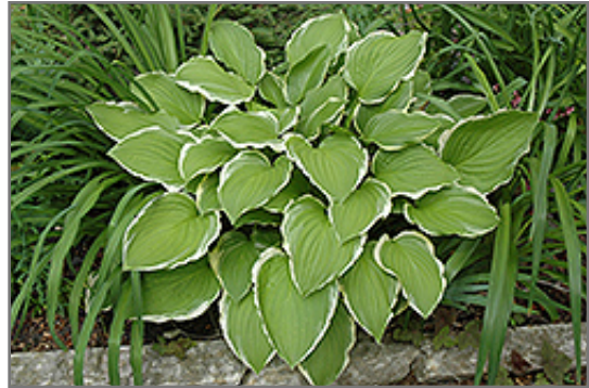
Sugar And Cream Hosta