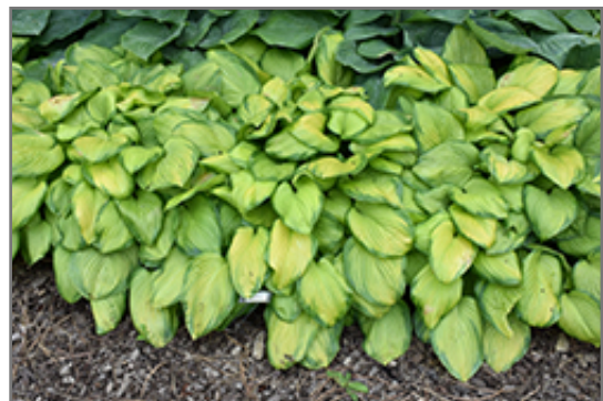
Stained Glass Hosta