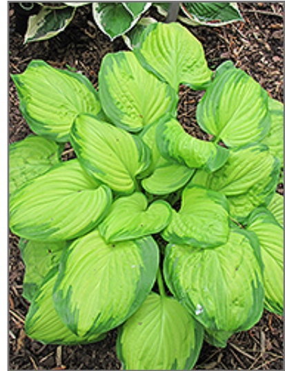
Stained Glass Hosta Photo courtesy of NetPS Plant Finder