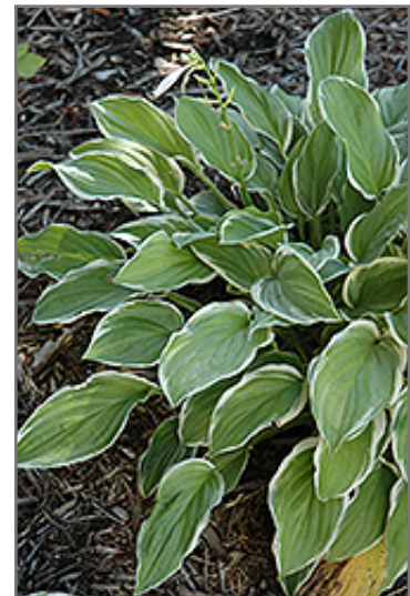
So Sweet Hosta foliage