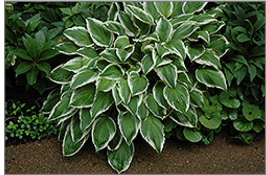
So Sweet Hosta