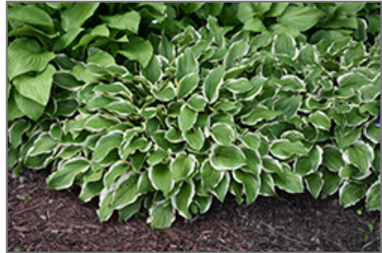
So Sweet Hosta

So Sweet Hosta will grow to be about 12 inches tall at maturity extending to 18 inches tall with the flowers, with a spread of 12 inches. When grown in masses or used as a bedding plant, individual plants should be spaced approximately 10 inches apart. Its foliage tends to remain dense right to the ground, not requiring facer plants in front. It grows at a medium rate, and under ideal conditions can be expected to live for approximately 10 years. As an herbaceous perennial, this plant will usually die back to the crown each winter, and will regrow from the base each spring. Be careful not to disturb the crown in late winter when it may not be readily seen!