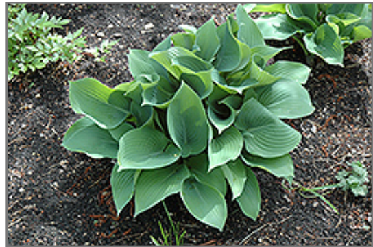
Reginald Kaye Hosta