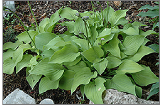
Royal Charm Hosta