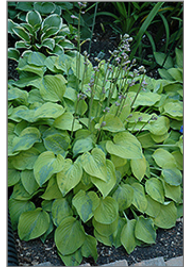
Radiant Edger Hosta

Luminous hosta with green center and gold margins, various shades of green and gold, slightly rippled; provides beautiful texture and contrast to other plants; lavender spikes of flowers in mid- summer