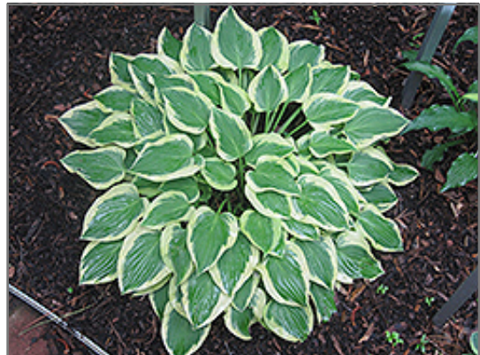
Pilgrim Hosta