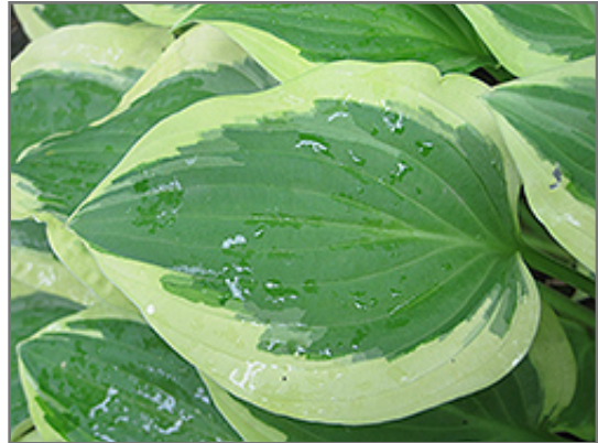
Pilgrim Hosta foliage

Pilgrim Hosta is recommended for the following landscape applications;