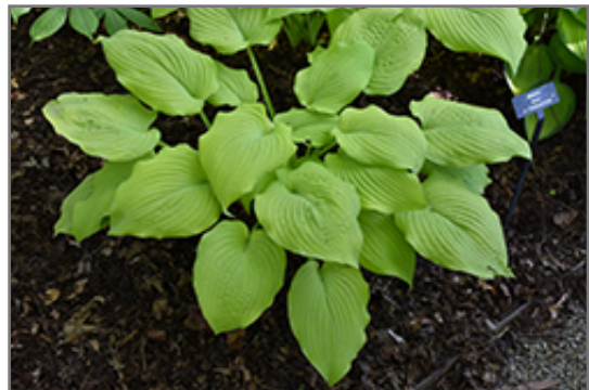
Piedmont Gold Hosta