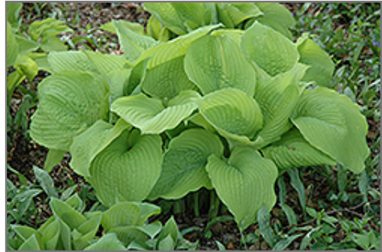
Piedmont Gold Hosta

Piedmont Gold Hosta is recommended for the following landscape applications;