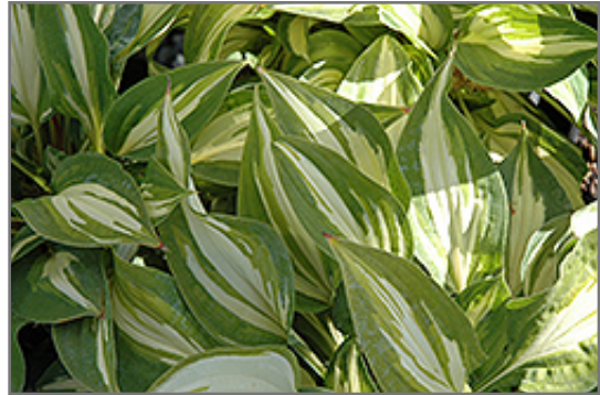
Peanut Hosta foliage