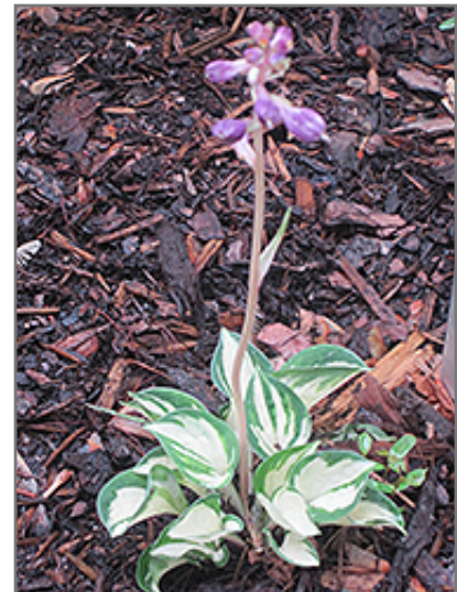
Pandora's Box Hosta