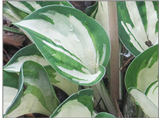
Pandora's Box Hosta foliage