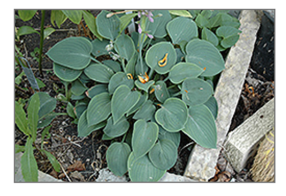
Pacific Blue Edger Hosta