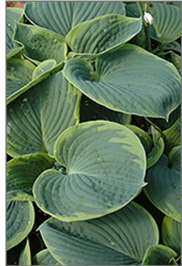
Olive Bailey Langdon Hosta foliage