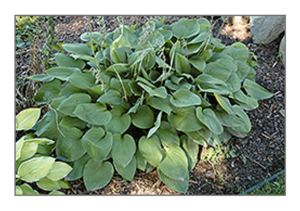
Obscura Hosta