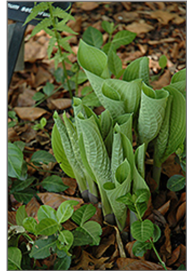
Lime Krinkles Hosta in spring