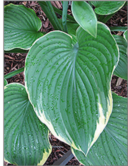
Leading Lady Hosta foliage