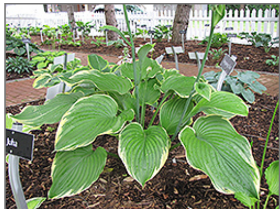
Leading Lady Hosta