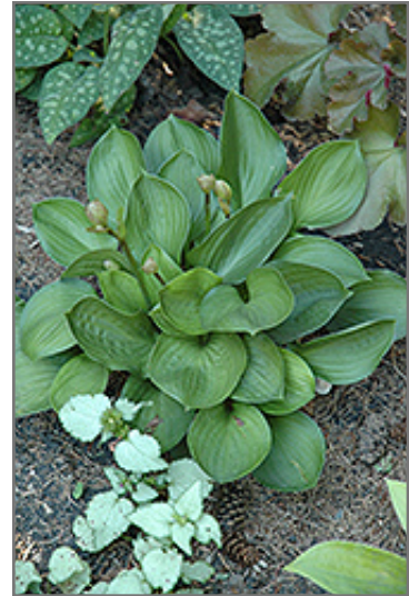
Lakeside Lollipop Hosta