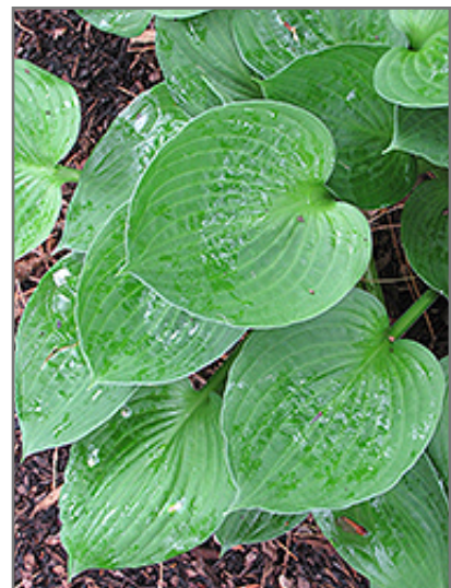
Lakeside Lollipop Hosta foliage