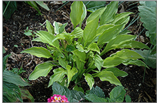
Lakeside Down Sized Hosta

Lakeside Down Sized Hosta is recommended for the following landscape applications;