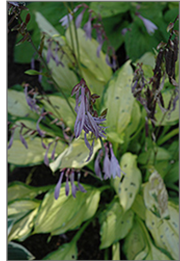
Lady Guinevere Hosta flowers