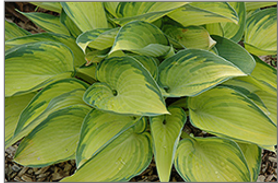
June Late Hosta foliage