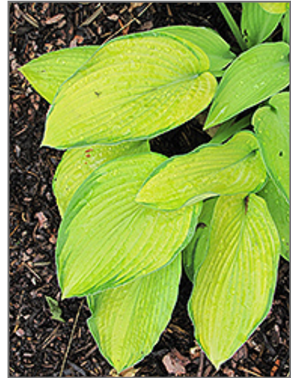
Inniswood Hosta foliage