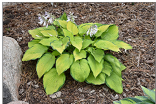
Inniswood Hosta