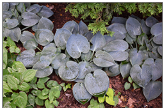
Hadspen Blue Hosta