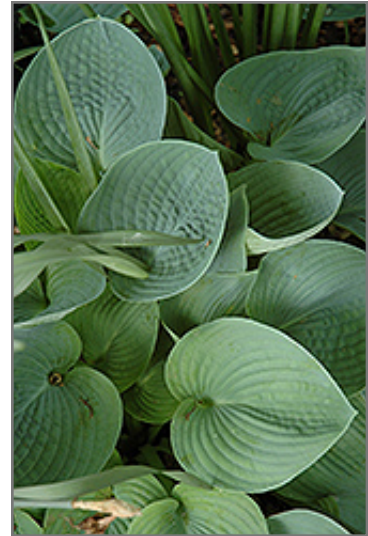
Hadspen Blue Hosta foliage

Hadspen Blue Hosta is recommended for the following landscape applications;