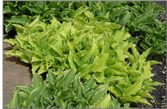
Gold Medallion Hosta