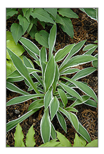
Ginkgo Craig Hosta

Ginkgo Craig Hosta is recommended for the following landscape applications;