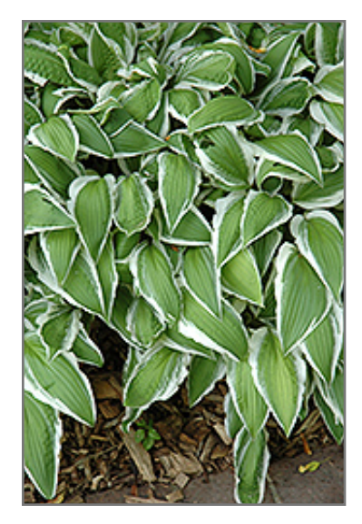
Ginkgo Craig Hosta foliage