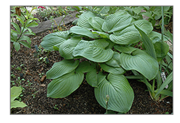
Fried Green Tomatoes Hosta