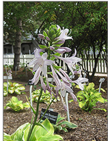
Fragrant Bouquet Hosta flowers