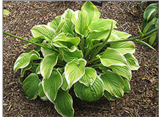
Fragrant Bouquet Hosta

This is a relatively low maintenance plant, and is best cleaned up in early spring before it resumes active growth for the season. Gardeners should be aware of the following characteristic(s) that may warrant special consideration;