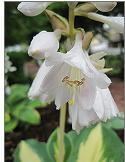
Dream Weaver Hosta flowers