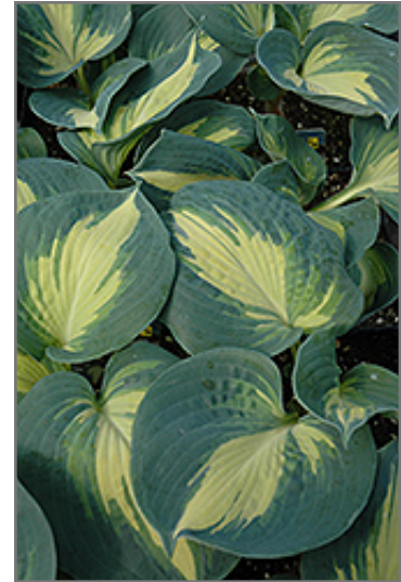
Dream Weaver Hosta foliage

Dream Weaver Hosta is recommended for the following landscape applications;