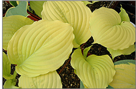
Dawn's Early Light Hosta foliage