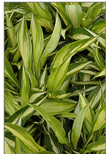
Cherry Berry Hosta foliage