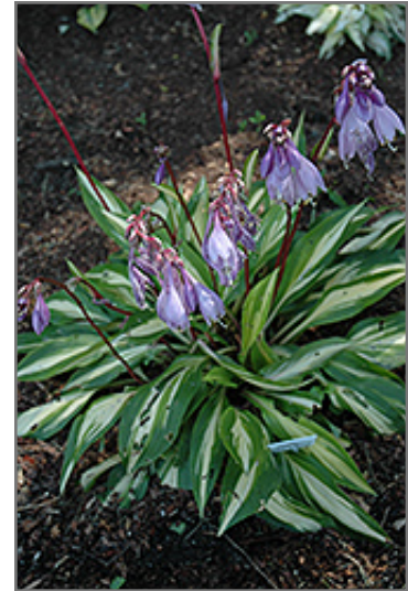
Cherry Berry Hosta in bloom

Cherry Berry Hosta is recommended for the following landscape applications;