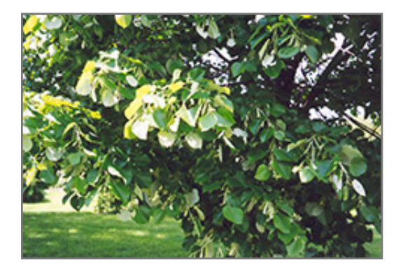
Silver Linden foliage