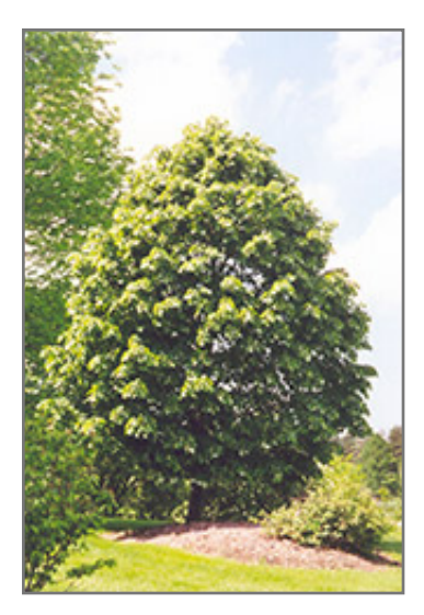
Silver Linden

This is a relatively low maintenance tree, and is best pruned in late winter once the threat of extreme cold has passed. It is a good choice for attracting bees to your yard. Gardeners should be aware of the following characteristic(s) that may warrant special consideration;