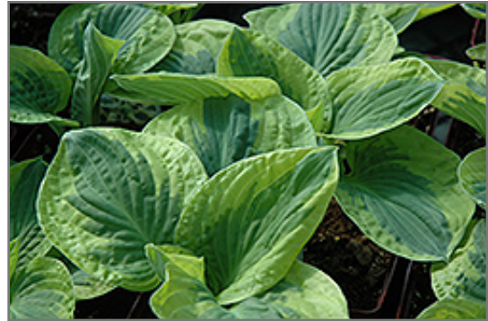
Brim Cup Hosta foliage