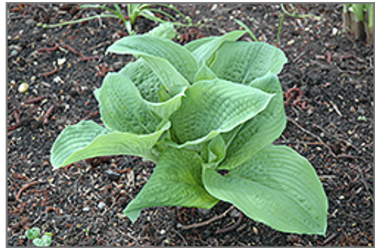
Bigfoot Hosta