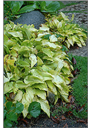
Anne Arett Hosta