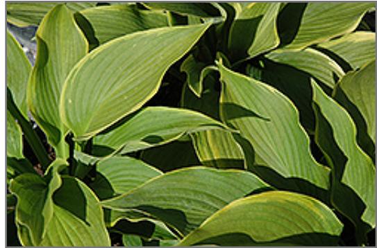
American Icon Hosta foliage