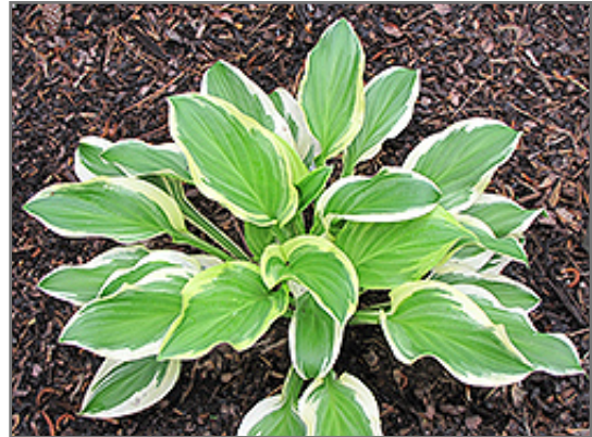
Alex Summers Hosta