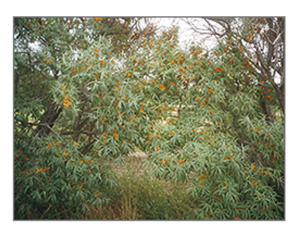
Indian Summer Sea Buckthorn fruit

This excellent large multi-stemmed color contrast shrub features fine silver foliage all season and edible orange berries in fall and winter, selected for its high yields; extremely tolerant of dry, alkaline soils