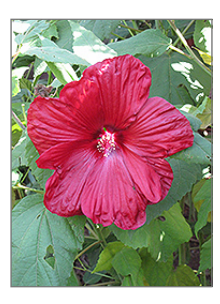
Disco Belle Red Hibiscus flowers