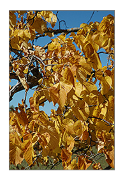
American Linden in fall

This tree should only be grown in full sunlight. It is very adaptable to both dry and moist locations, and should do just fine under average home landscape conditions. It is not particular as to soil type or pH. It is somewhat tolerant of urban pollution. This species is native to parts of North America.