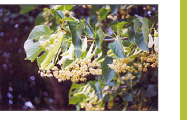
American Linden flowers

This is a relatively low maintenance tree, and is best pruned in late winter once the threat of extreme cold has passed. It is a good choice for attracting bees to your yard. Gardeners should be aware of the following characteristic(s) that may warrant special consideration;