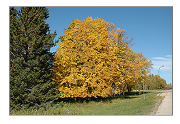
American Linden in fall

A stately native tree prized for its strongly pyramid-shaped form throughout life, clean habits and fragrant yellow flowers in early summer, will eventually grow quite large; very adaptable and low maintenance, a choice shade tree for large landscapes