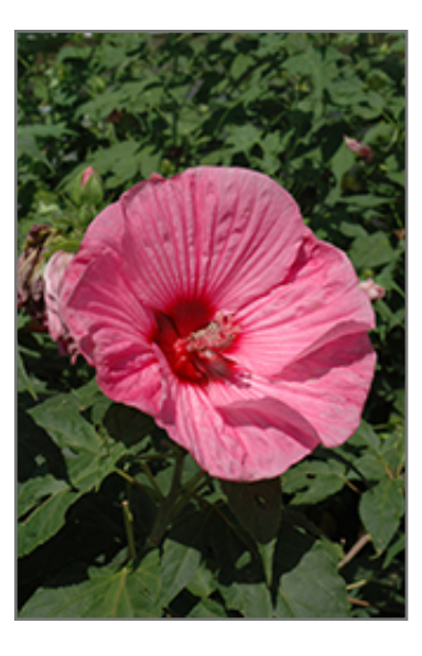
Plum Crazy Hibiscus flowers

This bold garden perennial features showy ruffled, lavender-pink flowers w/dark-red eye; attractive, glossy, large, dark-green/bronze leaves; ideal for the mixed garden border or in mass; do not allow to dry to wilting point