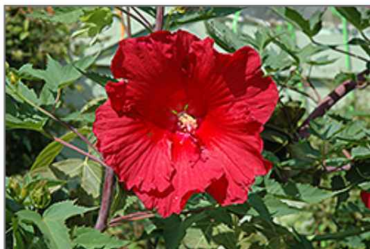
Fireball Hibiscus flowers

Other Names: Rose Mallow, Hardy Hibiscus