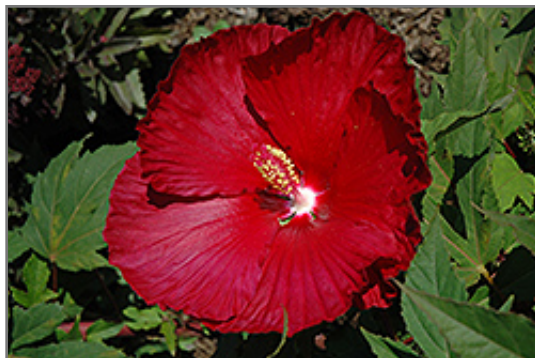
Cordial Cinnamon Grappa Hibiscus flowers

This bold garden perennial features very showy red flowers with large, glossy, bronze-green leaves; ideal for the mixed garden border or in mass plantings; beware of Japanese Beetles; do not allow to dry to wilting point