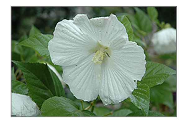
Blue River II Hibiscus flowers