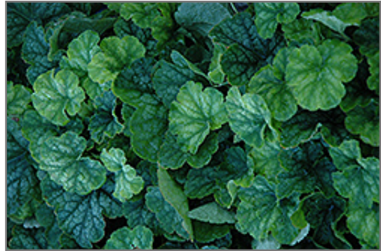
Crimson Clouds Foamy Bells foliage