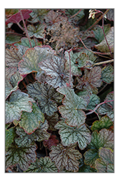
Pinot Noir Hairy Alumroot foliage

Dainty spikes of creamy bells rise from a compact mound of silver foliage, contrasting with purple-gray veins; amazing contrast to other plants; great versatility; keep soil moist in heat of summer