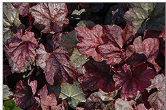
Beaujolais Hairy Alumroot foliage