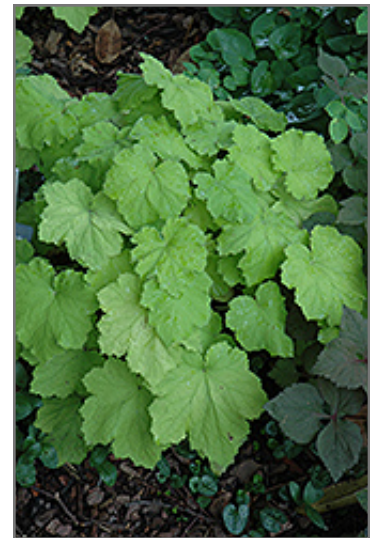
Pistache Coral Bells