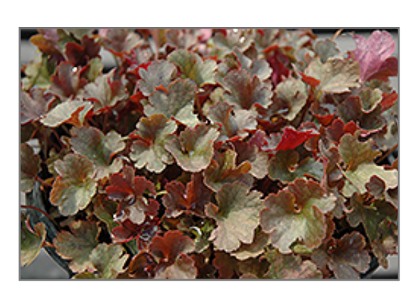
Petite Pearl Fairy Coral Bells foliage

Dainty spikes of pink bells rise from a compact mound of burgundy-bronze foliage spotted with silver; amazing contrast to other plants; great versatility; keep soil moist in heat of summer