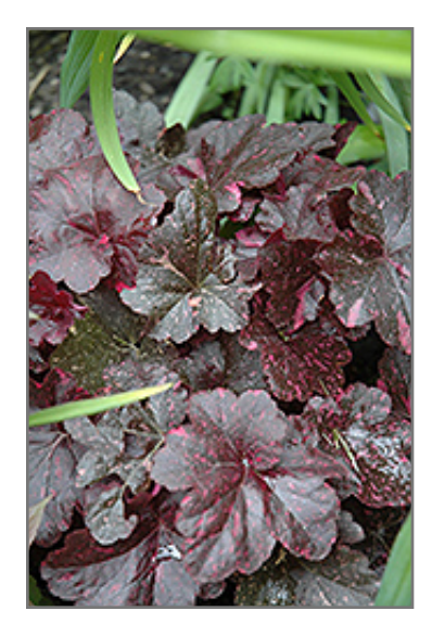
Midnight Rose Coral Bells foliage