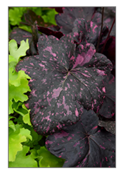
Midnight Rose Coral Bells foliage

Midnight Rose Coral Bells is recommended for the following landscape applications;