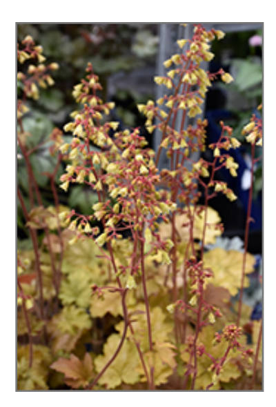
Ginger Ale Coral Bells foliage

Ginger Ale Coral Bells will grow to be only 6 inches tall at maturity extending to 12 inches tall with the flowers, with a spread of 15 inches. When grown in masses or used as a bedding plant, individual plants should be spaced approximately 12 inches apart. Its foliage tends to remain low and dense right to the ground. It grows at a medium rate, and under ideal conditions can be expected to live for approximately 10 years. As an evegreen perennial, this plant will typically keep its form and foliage year-round.