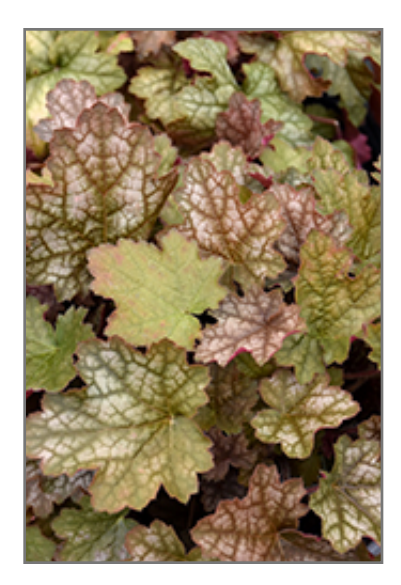
Ginger Ale Coral Bells foliage

This is a relatively low maintenance plant, and should be cut back in late fall in preparation for winter. It is a good choice for attracting hummingbirds to your yard. It has no significant negative characteristics.