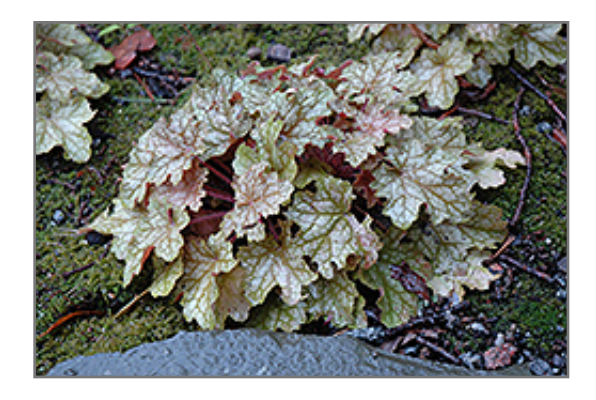
Ginger Ale Coral Bells